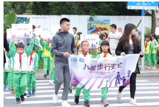
Volunteers join in our in-school activities