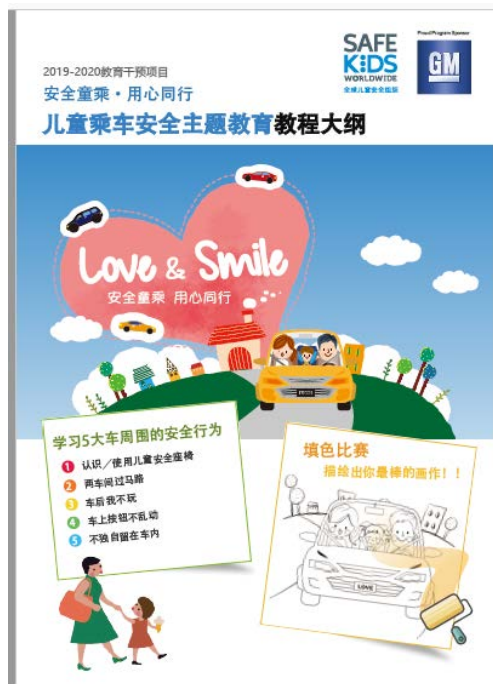
Curriculum Briefing to Teachers and Volunteers