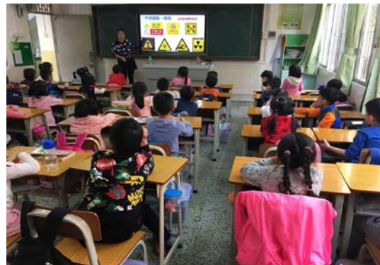
Education In Kindergartens & Schools through teachers, SK educators and volunteers