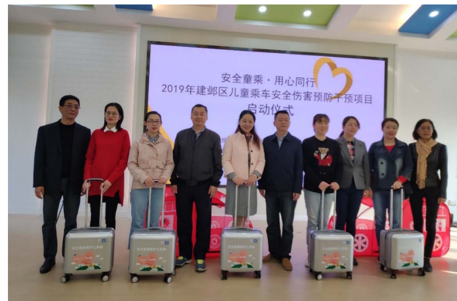
Educational Tool Box --- Magic Box to kindergartens