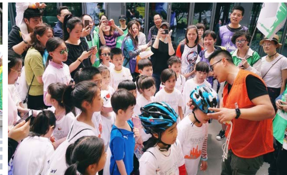
Interactive Activity with Families