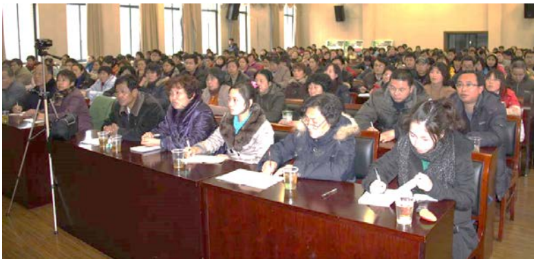
Training to Teachers Of Schools and Kindergartens

Over the past 20 years, we've covered more than 40 cities, Accumulatively reached over 7 million parents and children.